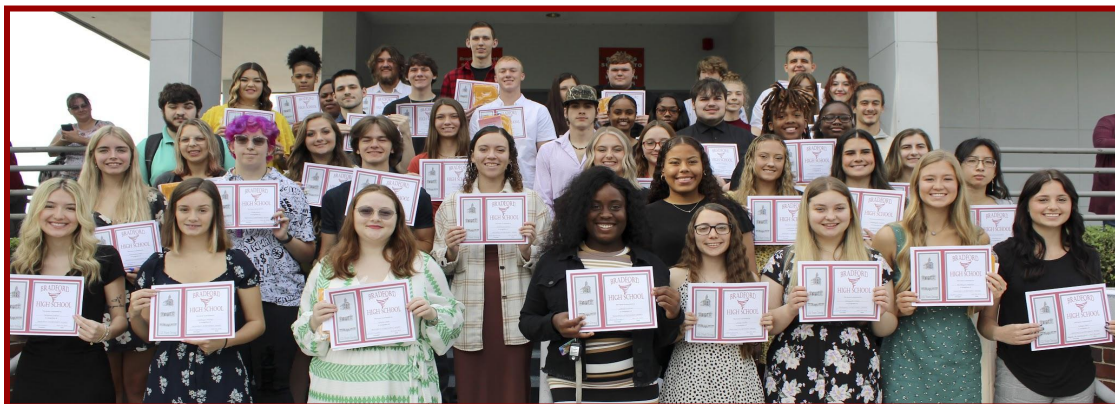
Principal's Achievement Awards Recipients