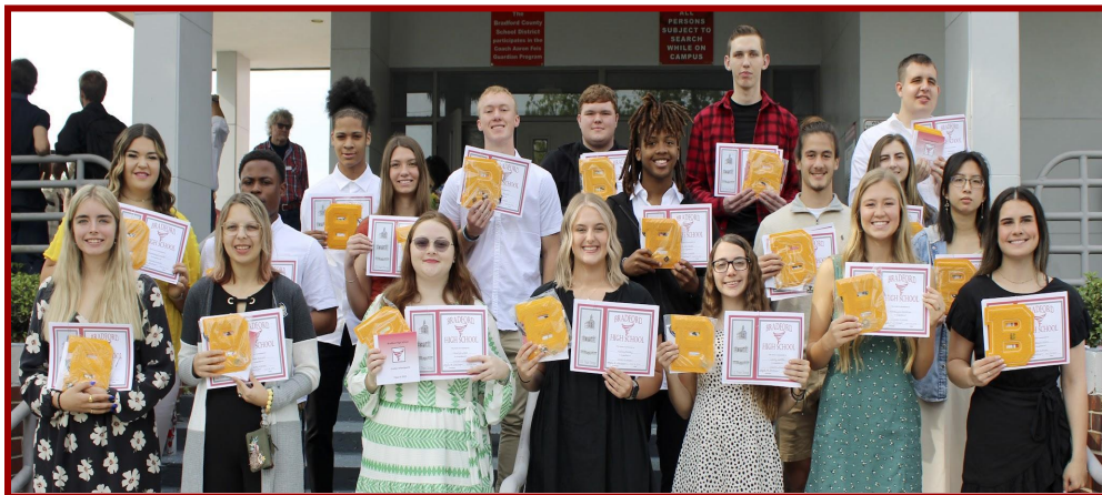
Golden B Recipients

On April 28th, the Bradford County Education Foundation sponsored and hosted the Golden B and Principal Achievement awards for the 2023 Senior Class at 9 am. in the BHS Auditorium. There were 19 recipients that received the Golden B award. Requirements to qualify included good attendance, behavior, and at least a 3.5 GPA and being in the top 10% of their class. Many of these students were dual enrolled and all of them had several extracurricular activities. These students received a golden B pin and letter, along with a Golden B book that featured pictures and a list of accomplishments for each student honored. There were 49 recipients of the Principal's Achievement award, who received a certificate and Principal Award pin. All awards were provided by the Education Foundation. Immediately following the event, BCEF also hosted a reception for the students and their families.